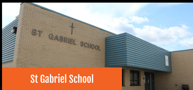
St Gabriel School

585 Signal Road, Fort McMurray, AB T9H 4V3 Elementary school