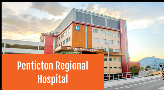
Penticton Regional Hospital

550 Carmi Ave, Penticton, BC V2A 3G6 Restoration/Maintenance