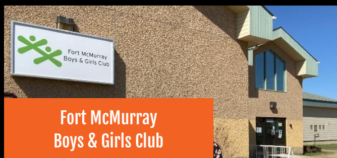
Fort McMurray Boys & Girls Club

20 Riedel St, Fort McMurray, AB T9H 3E1 Boys & Girls Club