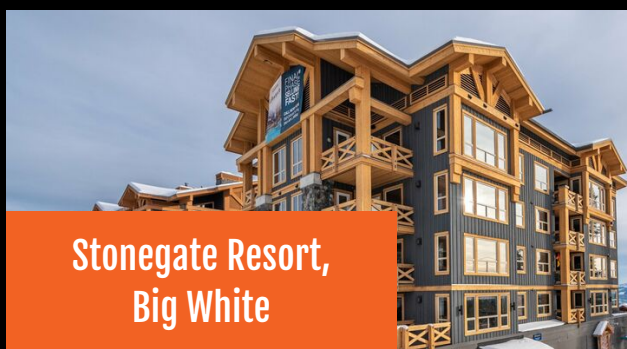
Stonegate Resort, Big White

5300 Big White Rd Kelowna, BC V1P 1P3 Renovation