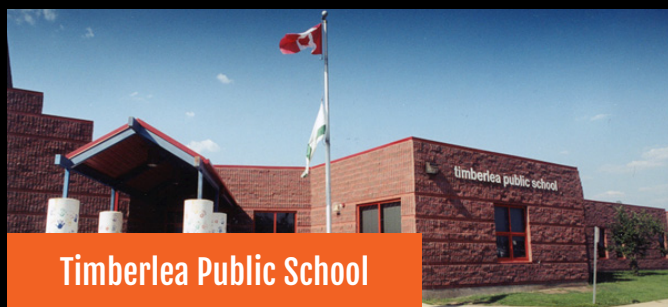
Timberlea Public School

107 Brett Dr, Fort McMurray, AB T9K 1V1 Elementary School