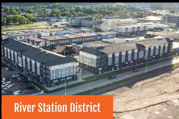
River Station District

8106 Fraser Ave Fort McMurray, AB T9H 1W6 84 Condos, 72 Hotel Suites & 60,000 S.F. Commercial