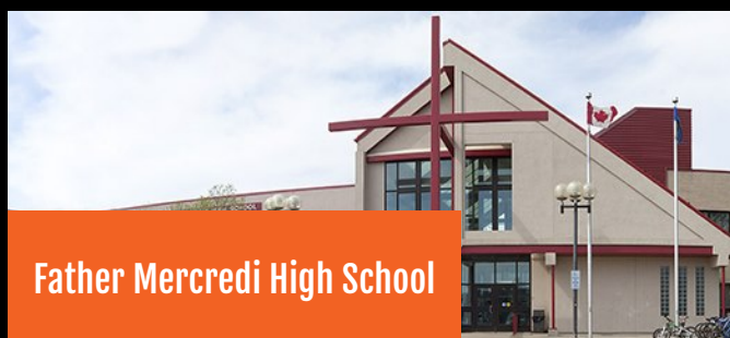
Father Mercredi High School

455 Silin Forest Rd, Fort McMurray, AB T9H 4V6 High school