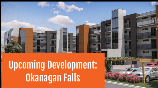
Upcoming Development: Okanagan Falls

5356 8 Ave Okanagan Falls, BC V0H 1R4 48 High-end Apartments & Condos on Skaha Lake