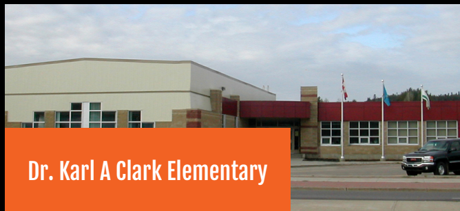
Dr. Karl A Clark Elementary

8453 Franklin Ave, Fort McMurray, AB T9H 2J2 Elementary School